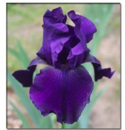
Yvonne B Burke