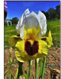
Eye Of Darkness AB