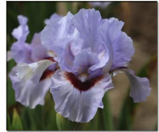
Keep An Eye Out AB