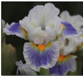
On The Horizon SDB