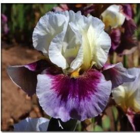
Stare Into My Eyes AB