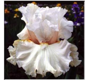
Bride's Blush RE