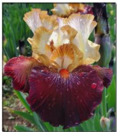
Maroon Bells Glow