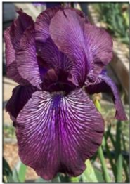
Akela Flats AB