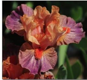
Arms Of Love SDB