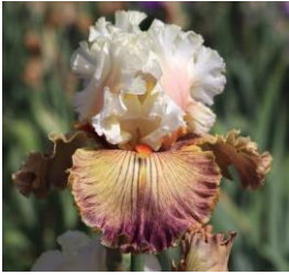
All Lined Up