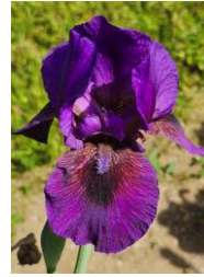
Easter Weekend AB