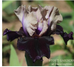
Ball and Chain IB