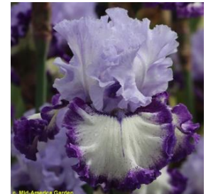
Running in Circles