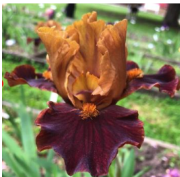
Semi Sweet IB