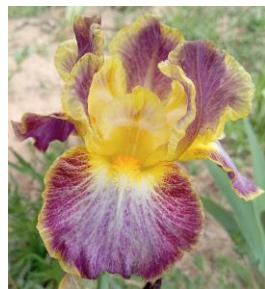
Light of My Life