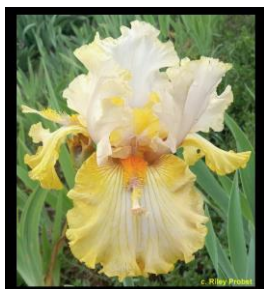
Spirit of Adventure