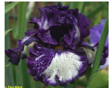
Make up your Mind