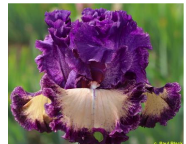
Wild About You