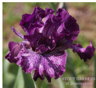
Pitch a Fit