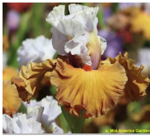
Flip a Coin