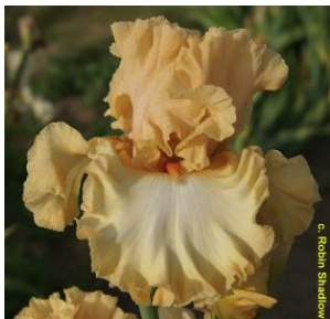
If You Come Softly