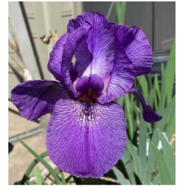
Chihuahua Evening AB