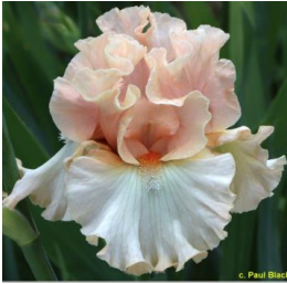
Divine Enchantress BB