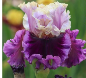
For The Ages