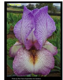
White Noise AB