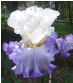
Snow Over Tahoe