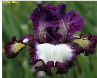
Come And Dance