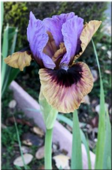
'Creative Art' AB