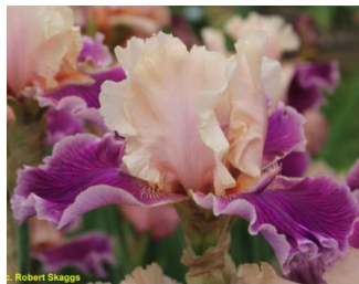
Red Frog Flyin