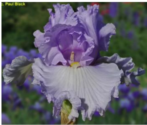
I Like Lace