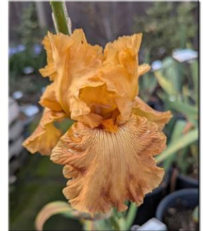
'Feeling Spicy Tonite'