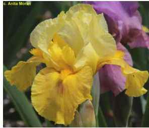
Elf Light For Peggy AB