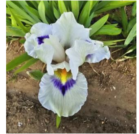
Dart Mission AB