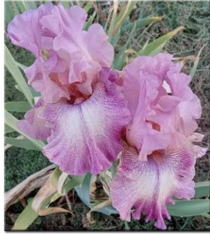
Cereghino Sdlg #17-4-1