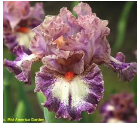
Love Life IB