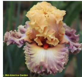
Moment Of Reflection