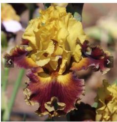
One Way Or Another