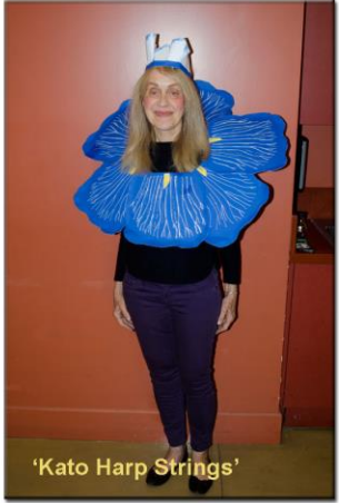
'Kato Harp Strings'