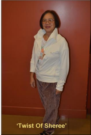
'Twist Of Sheree'