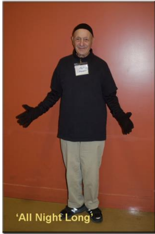
'All Night Long'