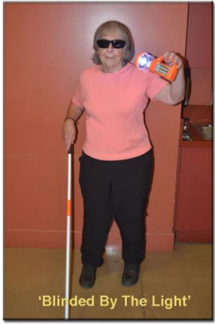
'Blinded By The Light'