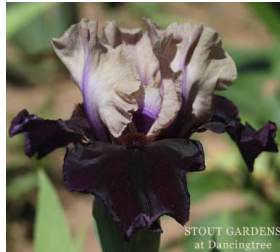
Ball and Chain IB