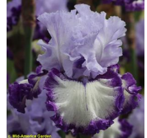
Running in Circles