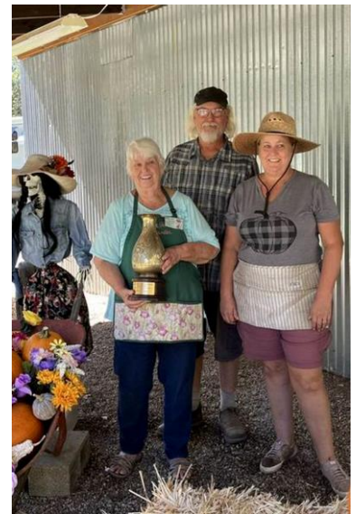
Horton's Iris Farm – winner of Larry Gaulter Award