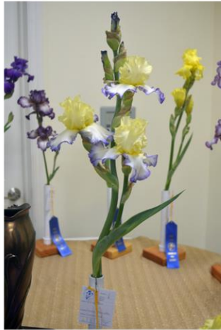
'Spring Bliss' Best of Show