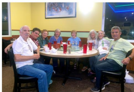
Dinner out Saturday Night