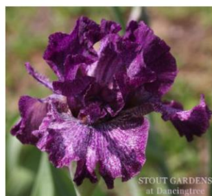
Pitch A Fit