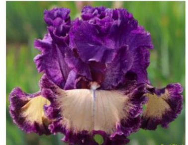
Wild About You