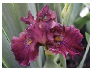
'Royston Rubies' TB