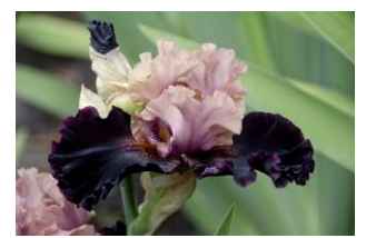
'Ninja Warrior' TB