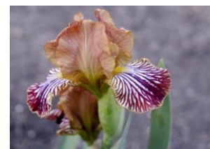
'Candy Basket' MTB