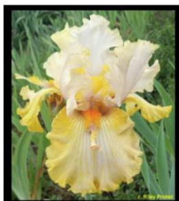
Spirit of Adventure