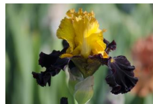
'Rise Like A Phoenix' TB