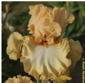
If You Come Softly