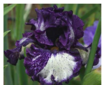
Make Up Your Mind