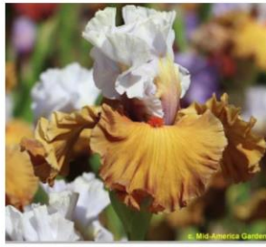
Flip A Coin