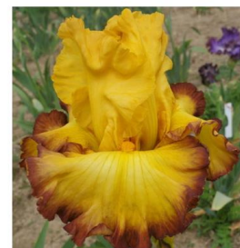
Power of Suggestion