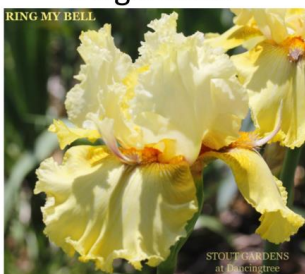
Ring My Bell TB SA