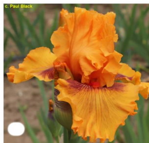
Blazing Orange BB