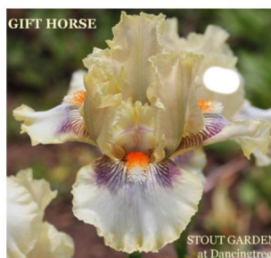
Gift Horse IB