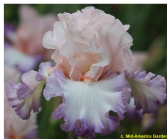
Just Between Us