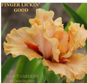
Finger Lickin' Good IB SA