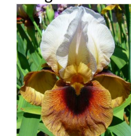
Shaman's Magic AB