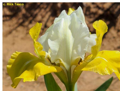
Astral Projection SDB SA