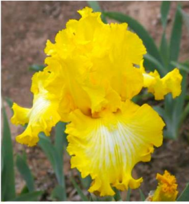
That's All Folks