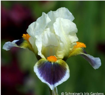
Easy Does It SDB