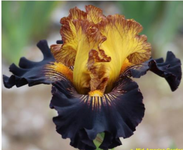
War of Words