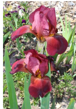
Noid 690 Leslie Rule’s 128th St Red TB; many have tried, but no ID yet.