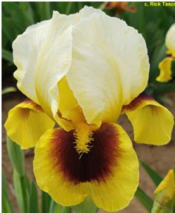
Better Than Ever AB OGB