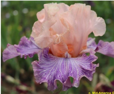
Gabby Gal TB SA