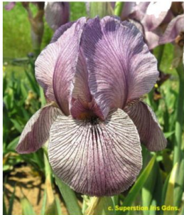
Alakazam AB OGB