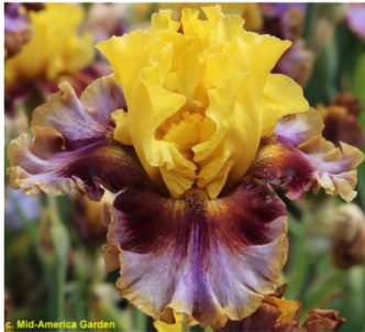
Born to Party