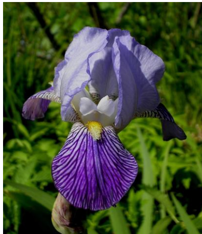
You’ve seen this in ROOTS before: my favorite noid, 312 Austin Healey, named after a dog who was named after a car.