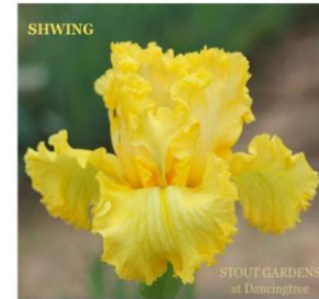
Shwing BB SA