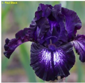
Absolute Perfection IB