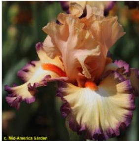
Follow My Lead