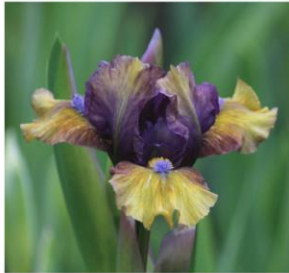
Psychedelic Dreams SDB