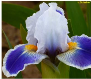
Baby Bruin SDB