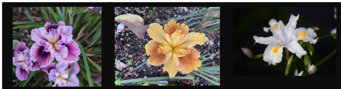
'Premonition of Spring'