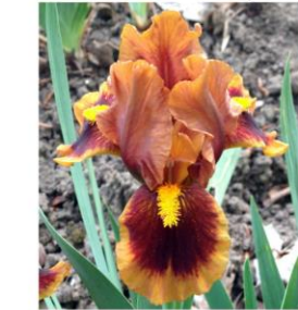
Gingerbread Trim SDB