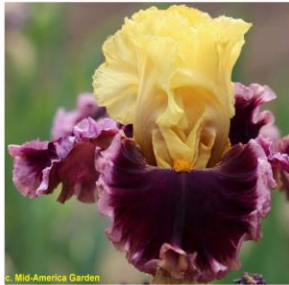
Head of the Class