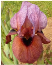
Bold Awakening AB/OGB