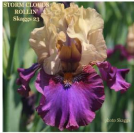
Storm Clouds Rollin'