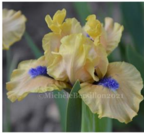
Endless Chain SDB