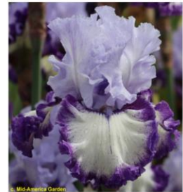
Running in Circles