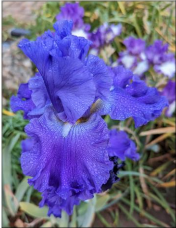
'Autumn Thunder' TB