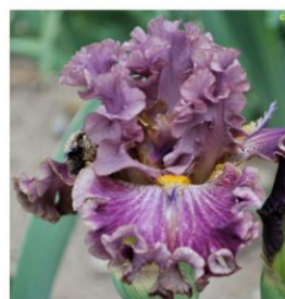
Feared Weird TB SA