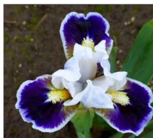
Bitty Beauty MDB