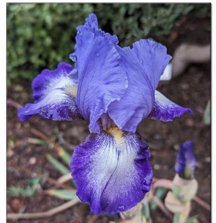
'Lovely Fran' TB