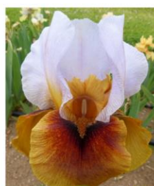
Golden Illusion AB