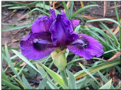
'Violet Storm' AB