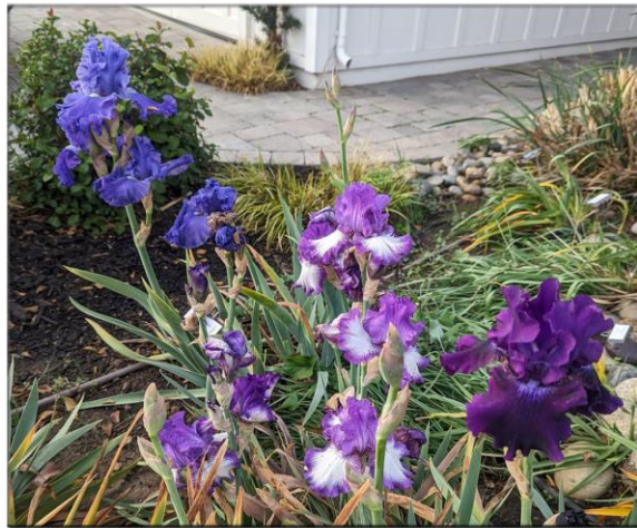
'Autumn Thunder', 'Bountiful Harvest' 'Rosalie Figge'