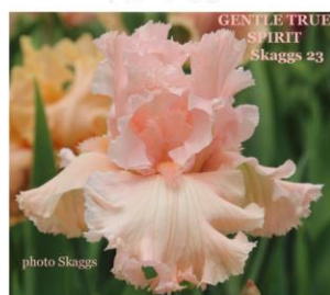
Gentle True Spirit BB