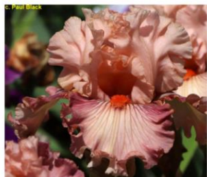
Pay the Piper BB