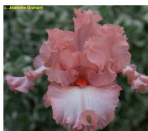
Il Etait Une Fois