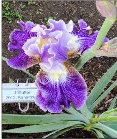
'I I Stutter' TB