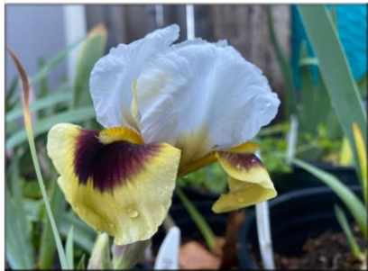
'Sun and Snow' AB