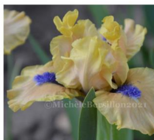
Endless Chain SDB