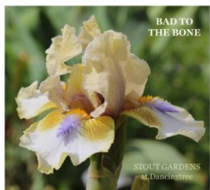
Bad to the Bone IB SA