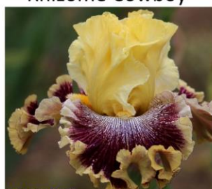
This is Crazy