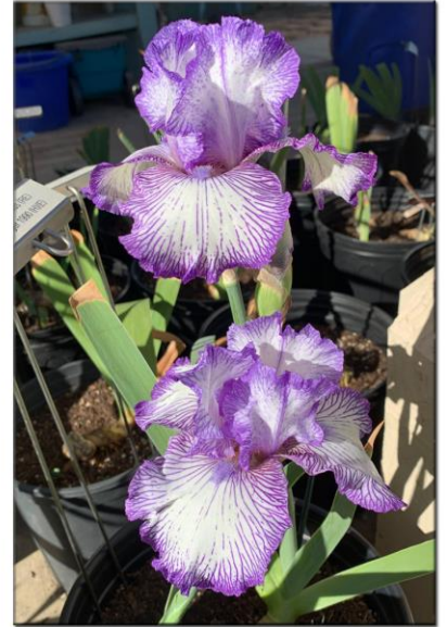
'Autumn Circus' TB