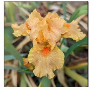
'Forever Orange' SDB