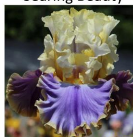
Words of Wisdom