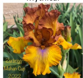
Sparks to a Flame