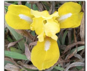
'Thrice Blessed' SDB