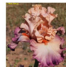
Love Me Forever