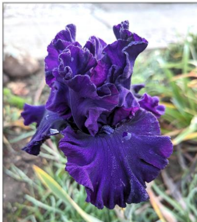
'Royalty Remembered' TB