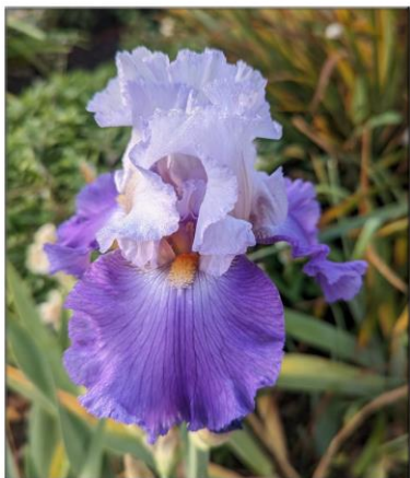
'Bolder Boulder' TB