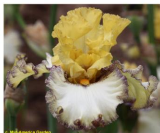
All Stitched Up