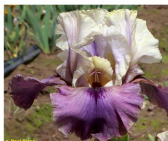
Desert Dynamo AB OGB-