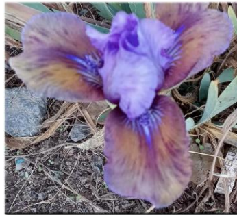
'Blueberry Tart' SDB