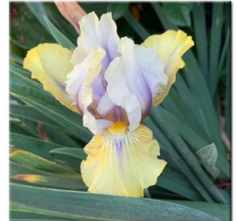
'Double Your Fun' SDB