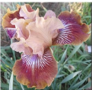
'Fall Decor' IB