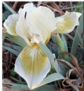
'Murphy's Law' SDB