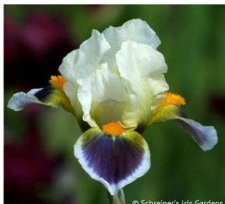
Easy Does It SDB