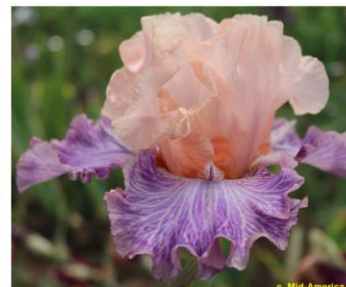
Gabby Gal TB SA