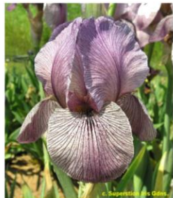
Alakazam AB OGB