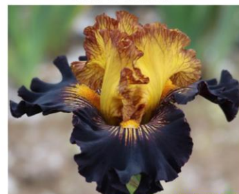
War of Words