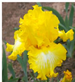
That's All Folks