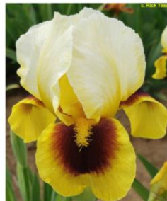
Better Than Ever AB OGB