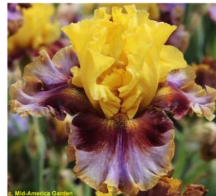
Born to Party