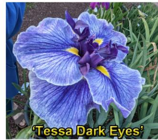
'Tessa Dark Eyes'