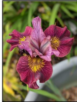
'Rubies on Tap'