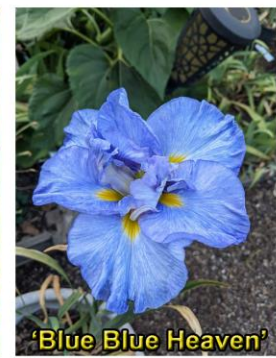
'Blue Blue Heaven'