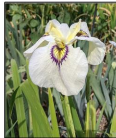
'Alabama Blue Fin'