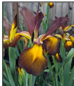
'Missouri Iron Ore'