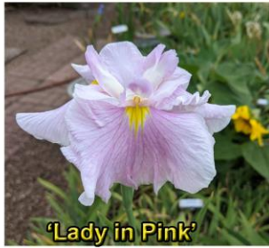
'Lady in Pink'