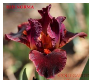
Red Norma SDB