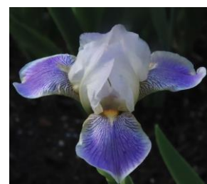
Sky Angel MTB