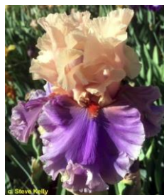
Don't Talk Back