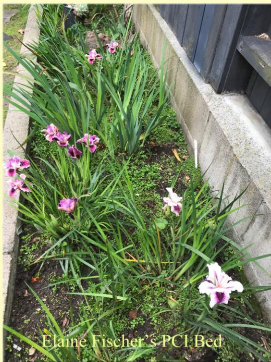
Elaine Fischer's PCI Bed