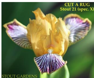
Cut A Rug SPX