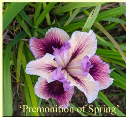
'Premonition of Spring'