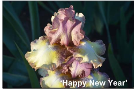
'Happy New Year'