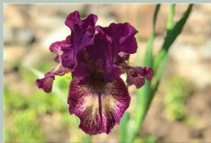
'Power Surge' TB