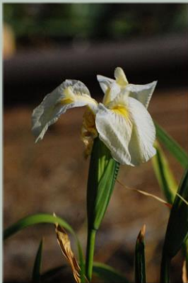
'French Buttercream' SPX