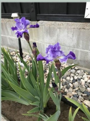
'Daughter of Stars' TB