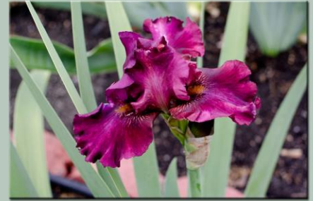
'Royston Rubies' TB