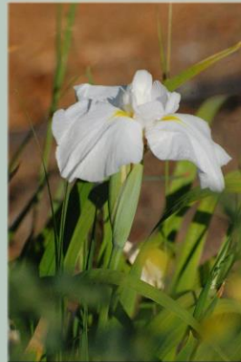
'Rainbow Darter' JI