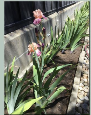
'Love Continues' TB