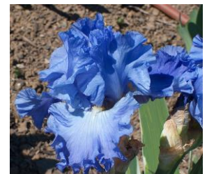
PIN STRIPED SUIT BB