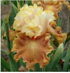
BEYOND THE RAINBOW