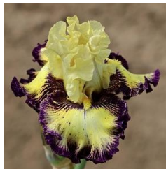
HOLD THE LINE