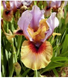
CREATIVE ART AB