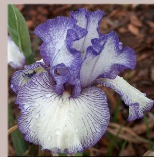
AUTUMN CIRCUS B. Hager 1990