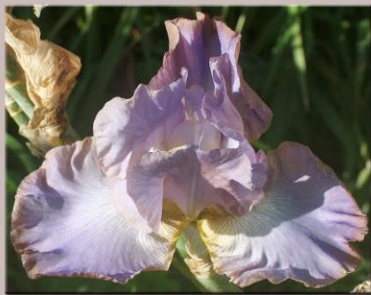
ANXIOUS B. Hager 1992