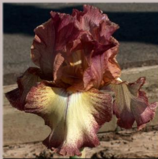
ARTISTIC SHOWOFF B. Wilkerson 2010