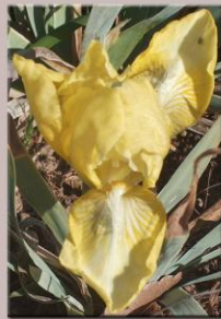
BABY BLESSED L. Zurbrigg 1979 SDB