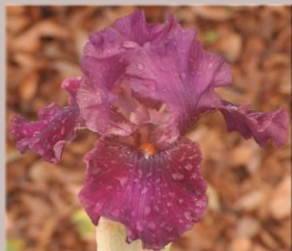
AUTUMN GARNET D. Spoon 2011