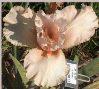
CAMEO BLUSH