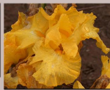
CORNHUSKER T. Stanek 2005