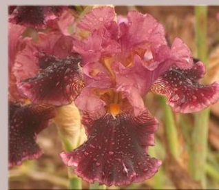
AUTUMN WINE V. Christopherson 2003 BB