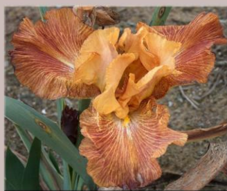
AUTUMN SHOWER M. Lockatell R. 2019