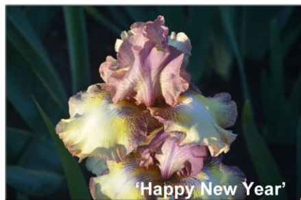
'Happy New Year'