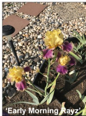
'Early Morning Rayz'