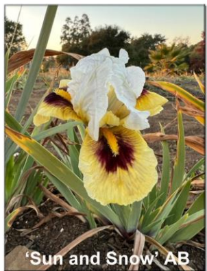
'Sun and Snow' AB