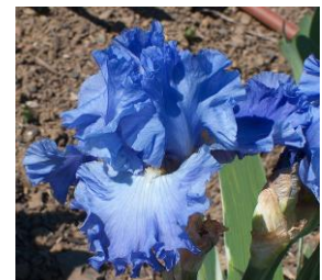
PIN STRIPED SUIT BB