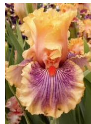
OUTSIDE THE LINES