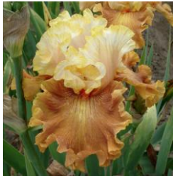
BEYOND THE RAINBOW