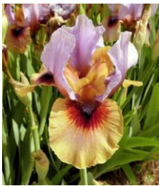
CREATIVE ART AB