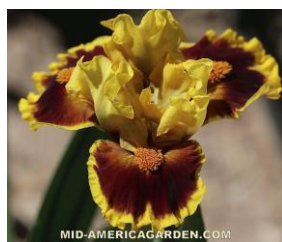
SEARING EMBERS SDB