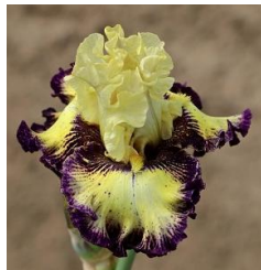
HOLD THE LINE