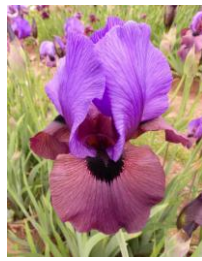
EYE OF EXCELLENCE AB