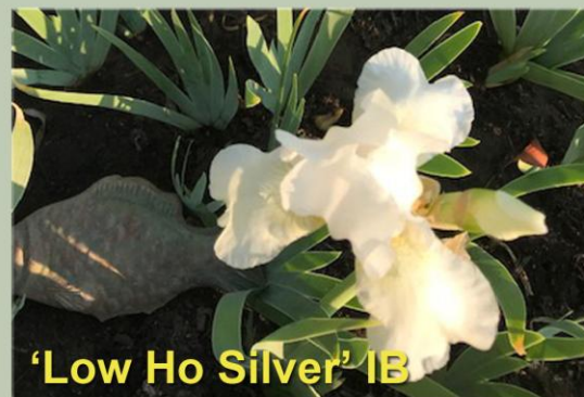
'Low Ho Silver' IB