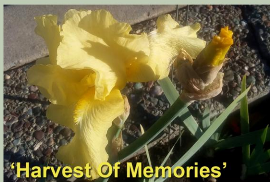
'Harvest Of Memories'