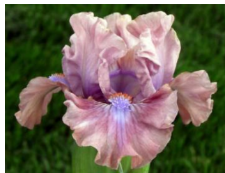
MAUVE MISTRESS SDB