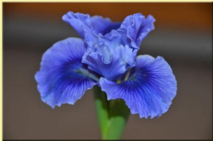
'Blue Plate Special'

Watch Garry Knipe's presentation on the next CBRIS Zoom Meeting!