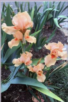
'Many Mahalos' IB