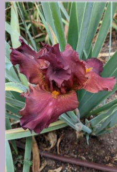
'Lest We Forget'