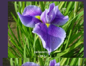
Enchanted Lake JI