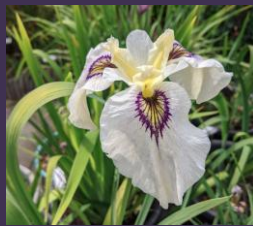
Alabama Blue Fin SPX