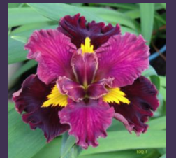
Velvet Ensemble LA