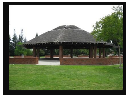
Gazebo at Ortega Park