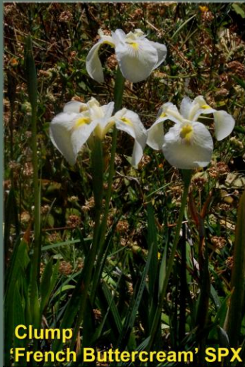
Clump 'French Buttercream' SPX