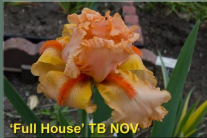
'Full House' TB NOV