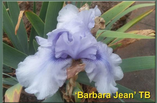
'Barbara Jean' TB