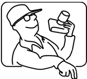
Photo credits for the following pages:

Helen Bliven, Carl Boro, Tracy Bunger, Carolyn Craft, Carol Dahout, Jane Jordan, Mikey Lango, John Pesek, and Bryce Williamson