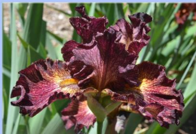
'Bam A Lam'