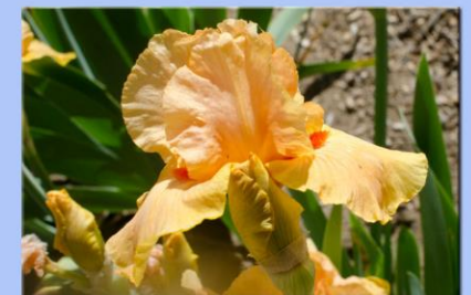
Sdlg -'Honey Way'