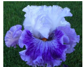
PEARL OF NITRA