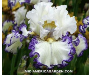
BRIGHT SHINING STAR