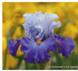
CUBS WIN IT