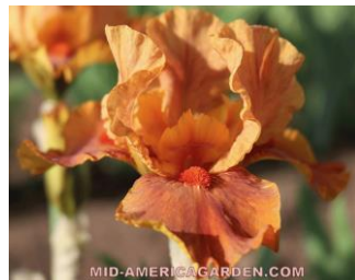
HALF SISTER IB