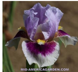
PANIC ATTACK AB