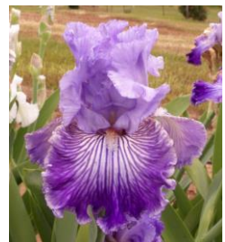
YOU'RE SO VEINED