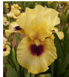
MOMENT IN THE SUN