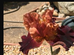
Cara Vainish Tall Bearded Seedling