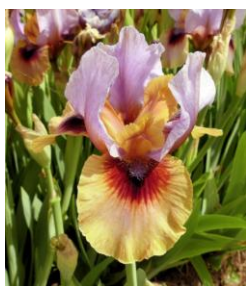
CREATIVE ART AB