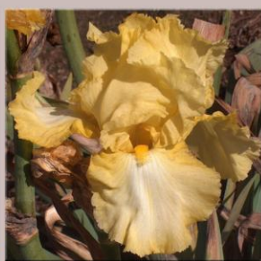
CORN DANCE D. Spoon 2008