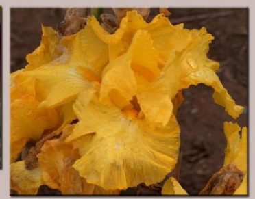
CORNHUSKER T. Stanek 2005