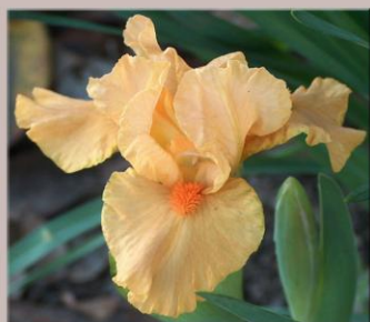
FOREVER ORANGE R, Tasco 2018 SDB