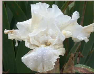
SODA FOUNTAIN SHUFFLE M. Lockatell 2015