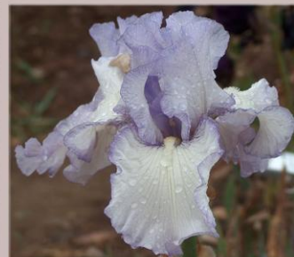
LADY ESSEX L. Zurbrigg 1991