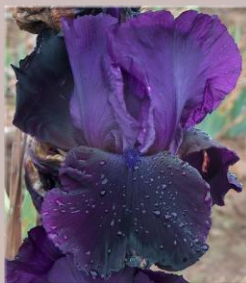
MIDNIGHT CALLER M. Byers 1990