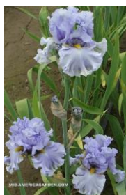
ADRIFT AT SEA