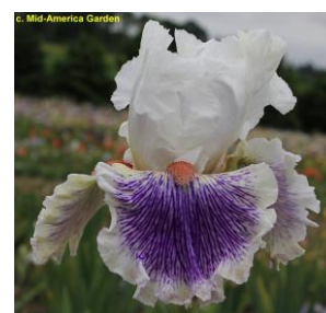
LEAVE ME BREATHLESS