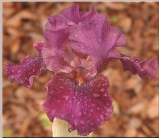
AUTUMN GARNET D. Spoon 2011