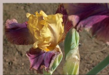
EARLY MORNING RAYZ D. Toth 2019