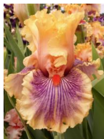
OUTSIDE THE LINES