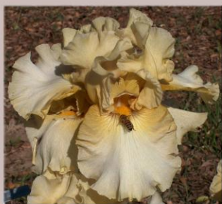
TEA LEAVES M. Byers 1987