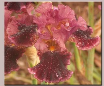
AUTUMN WINE V. Christopherson 2003 BB