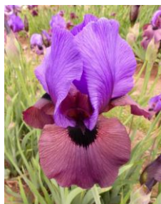
EYE OF EXCELLENCE AB