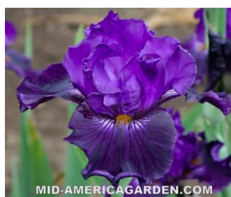
BLACK LABEL BB