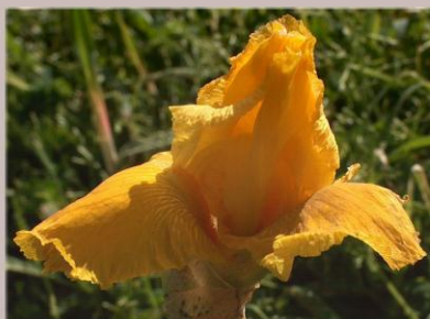
GOLD REPRIS W. Moores 1988