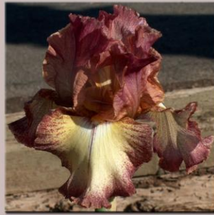
ARTISTIC SHOWOFF B. Wilkerson 2010