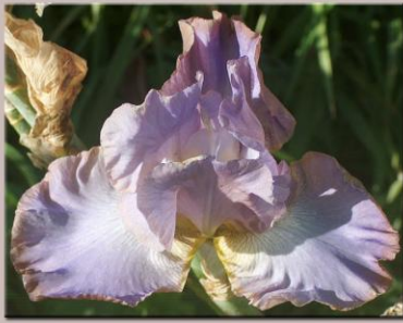
ANXIOUS B. Hager 1992