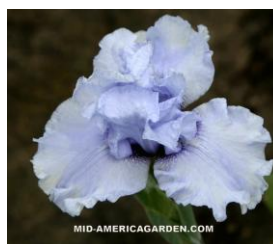
POISE AND CHARM BB