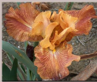
AUTUMN SHOWER M. Lockatell R. 2019