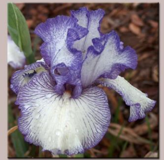
AUTUMN CIRCUS B. Hager 1990