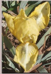
BABY BLESSED L. Zurbrigg 1979 SDB