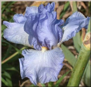
AZURE REPRISE W. Moores 1999