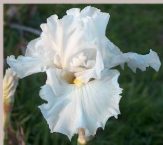
LUNAR WHITEWASH S. Innerst 2003