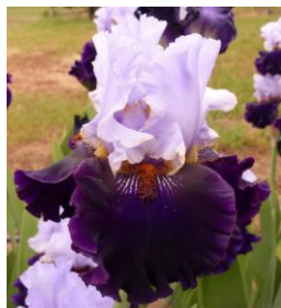
SEA OF DARKNESS