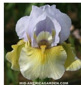
EERIE ENCOUNTER AB