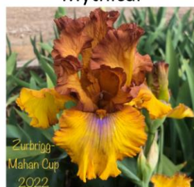
Sparks to a Flame