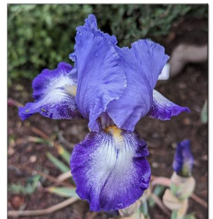
'Lovely Fran' TB