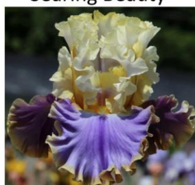
Words of Wisdom