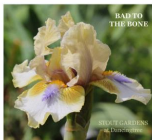
Bad to the Bone IB SA