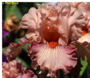
Pay the Piper BB