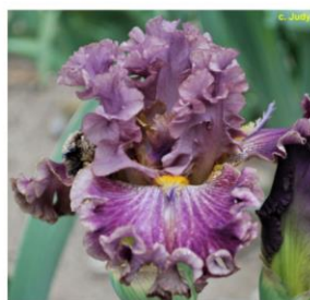
Feared Weird TB SA