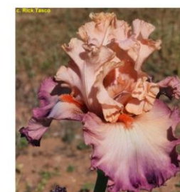
Love Me Forever