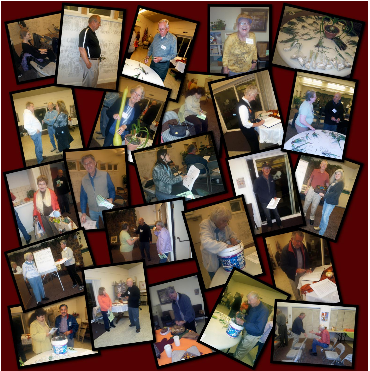
CBRIS November Meeting