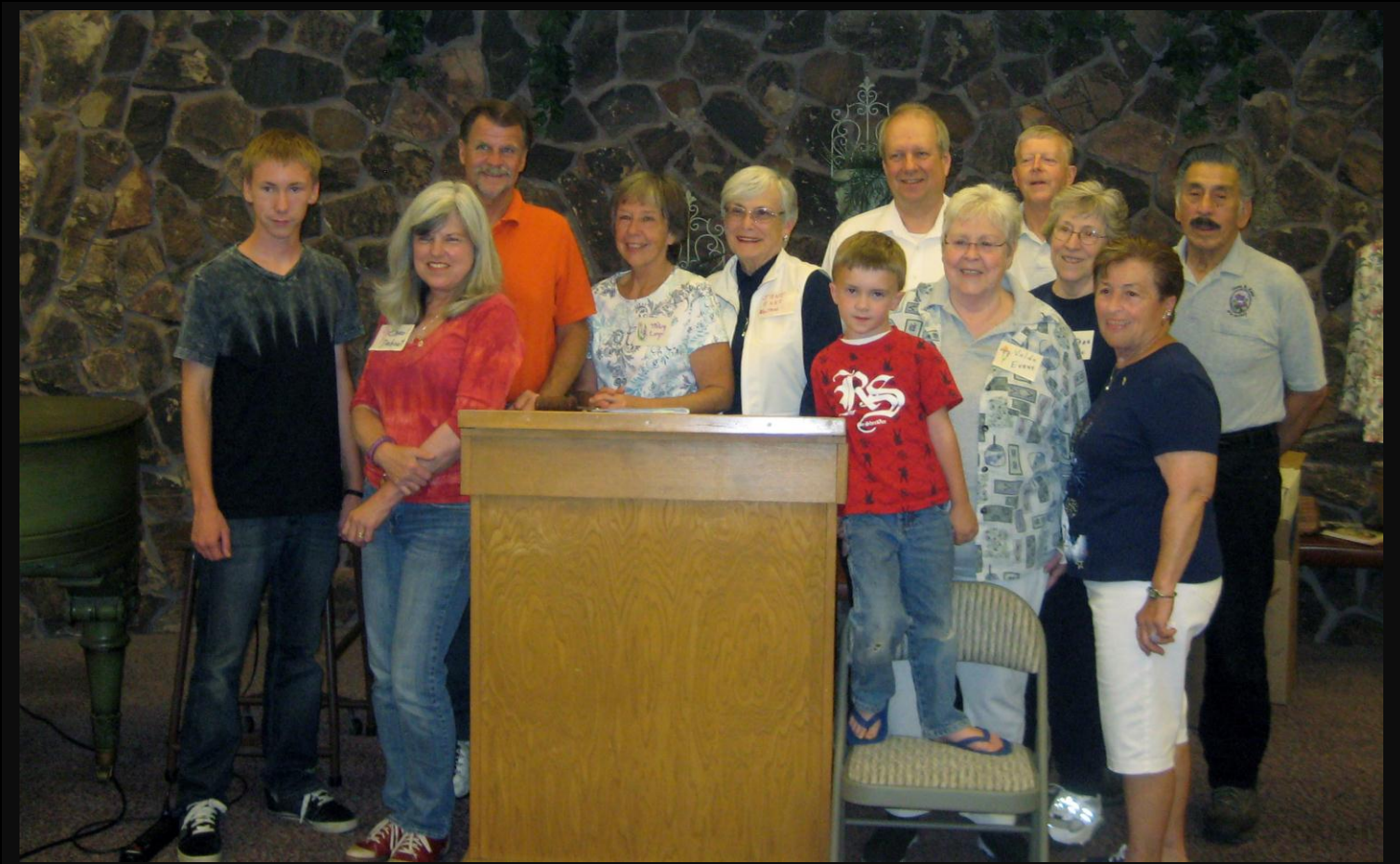
Awards were given out to the winners that were present at the June 2011 CBRIS Spring Show. Congratulations on a great Show!